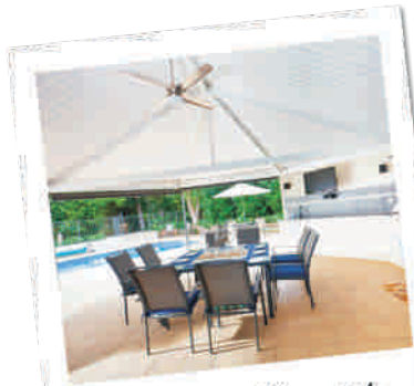
Patios & Verandahs

View our website www.spanline.com.au to find your local Spanline outlet.