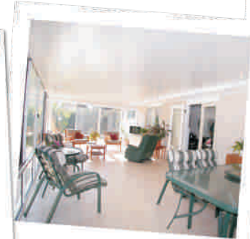
Insulated Roof Panels