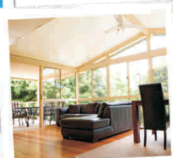
Glass & Screened Rooms